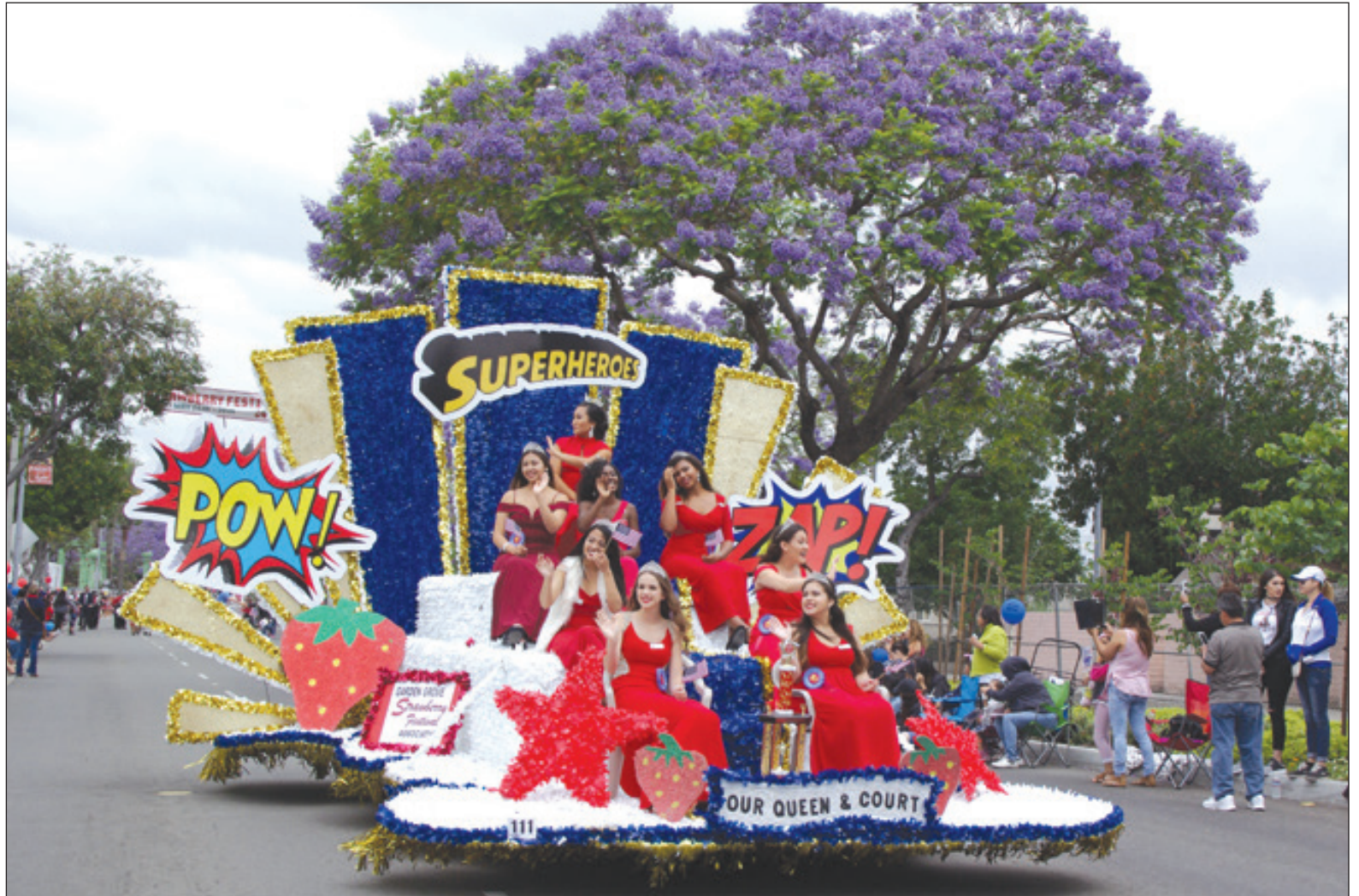
After a two-year hiatus, the Strawberry Festival returns on May 27-30. Shown here are beauty queens riding in a parade in previous years.