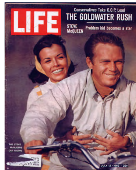
In their prime – the star couple.