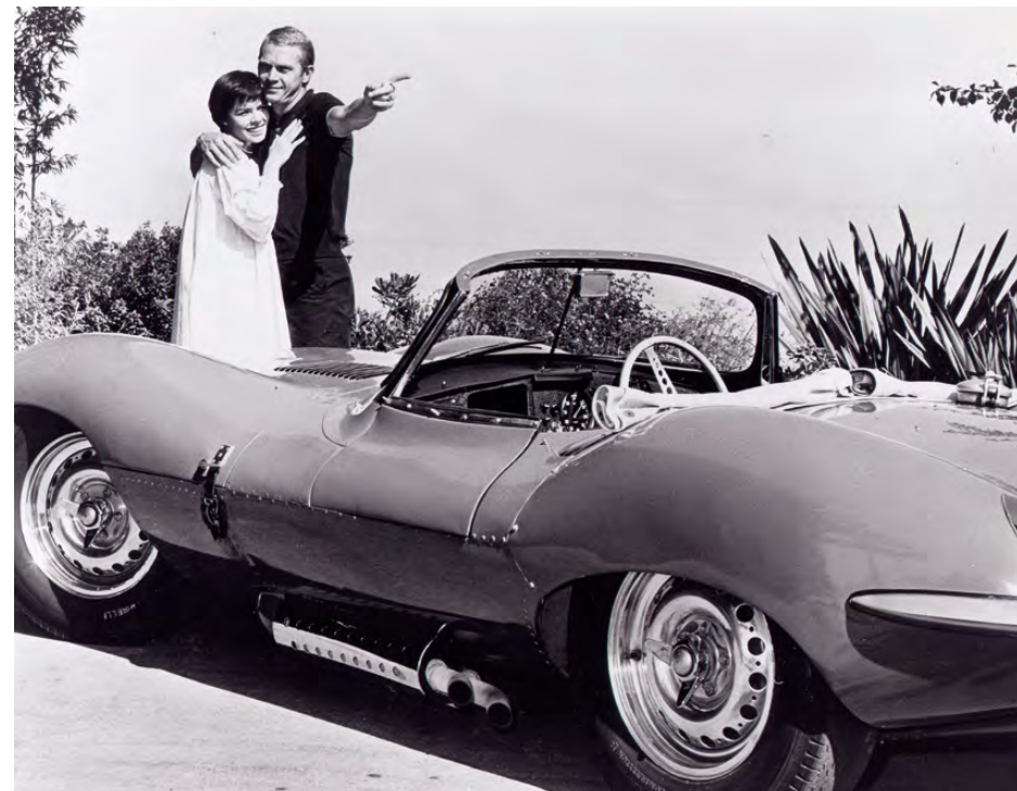
From two wheels to four.