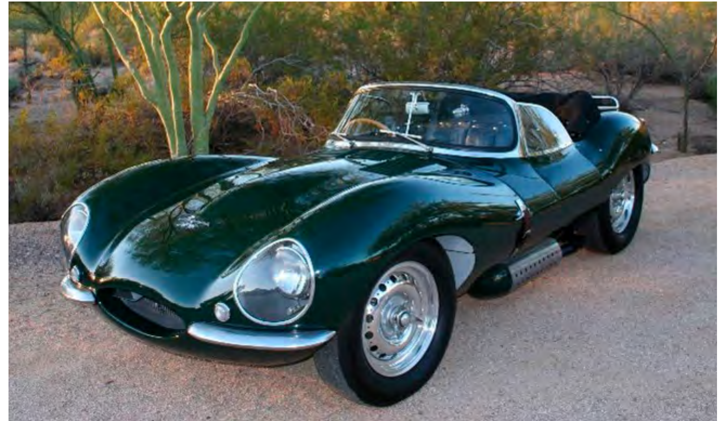
Gussied up with top, rack and sidescreens today.