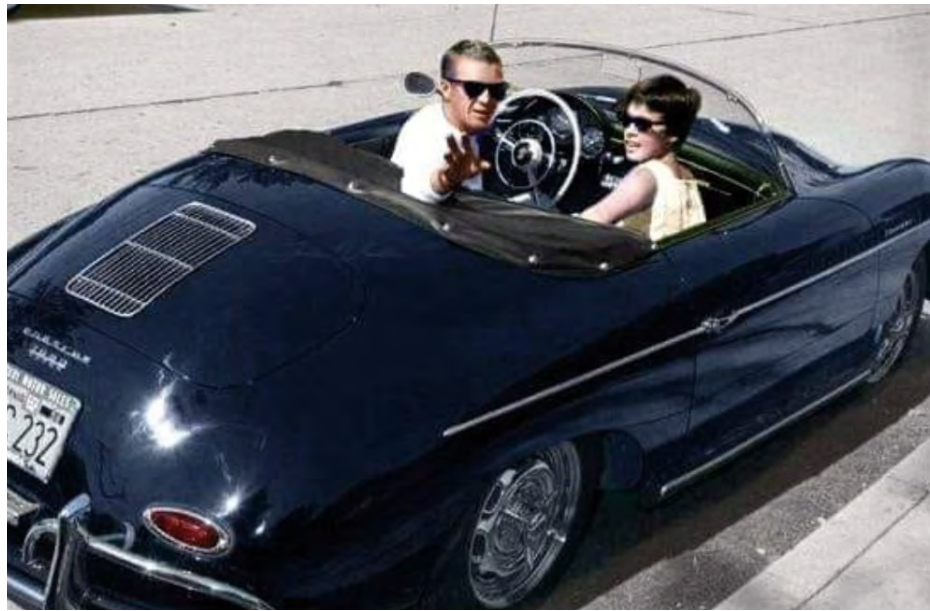
Before the XKSS: Steve and Neile in their Porsche 356 Speedster.