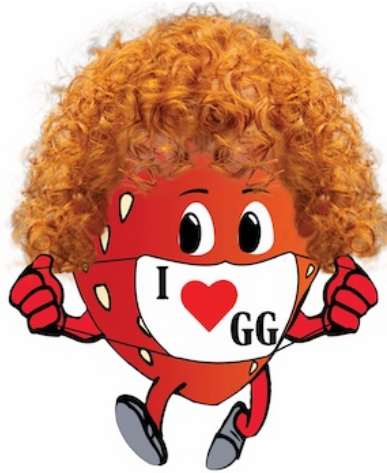
Photo submissions will be accepted from April 15, 2021 until May 7, 2021.

Are you, your child, or someone you know a knockout Redhead? If so, it's time to get some well-deserved FAME for the MANE. This contest is for ALL ages from infant on up.