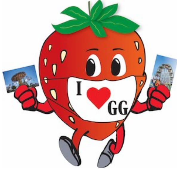
Photo submissions will be accepted from April 15, 2021 until May 7, 2021.

Winners will be contacted via email during the week of May 24th.