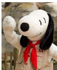
Knott’s Berry Farms Snoopy