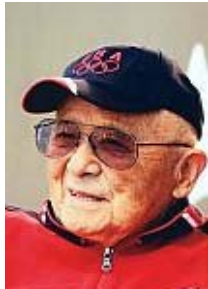
Olympian Dr. Sammy Lee