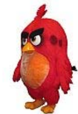
Angry Bird

The four-day charity event, the second largest city festival in the Western United States, will be held at the Village Green between Main Street and Euclid Avenue in downtown Garden Grove. Last year’s attendance was more than 300,000. Highlights include the Friday evening official giant strawberry cake-cutting ceremony at 6:00 p.m. at the Showmobile (Acacia & Main streets) when free strawberry shortcake is served to more than 2,000 people. On Saturday morning, there will be a City of Garden Grove sister-city 5K Run and a festival VIP celebrity breakfast at the Garden Grove Community Center, with proceeds going to Casa Garcia’s We Give Thanks. This is followed by a parade that starts at 10 a.m. with celebrities, floats, bands, equestrians, athletes and characters. All four festival days will include 35 carnival rides, four contests, over 200 food and shopping booths, games, music and live entertainment. Contests, held in the amphitheater, include the Berry, Berry Beautiful Baby Contest, Redhead Roundup, Strawberry Idol Karaoke and Tiny Tots King and Queen .