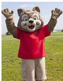
Great Wolf Lodge’s Wiley the Wolf

The festival will be held Memorial Day Weekend, Friday, May 27th through Monday, May 30th, 2016. Friday hours are 1:00 p.m. to 10 p.m.; Saturday and Sunday from 10 a.m. to 10 p.m. and Monday from 10 a.m. to 9 p.m. Admission is free. Special one-price ride-all-day wristbands will be offered at $30 per wristband on Friday and $35 each on Saturday, Sunday and Monday. Tickets for individual rides can also be purchased separately at $1 per ticket. Proceeds benefit local non-profits.