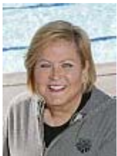
Olympian Shirley Babashoff